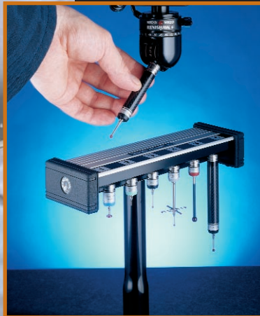
Fully compatible with probe modules from the extensive TP20 system range