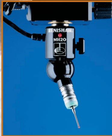
MH20 Ultra compact with fully adjustable orientation