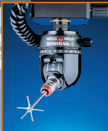
MH20i Repeatable indexing in a compact design

Improving the performance of Co-ordinate Measuring Machines